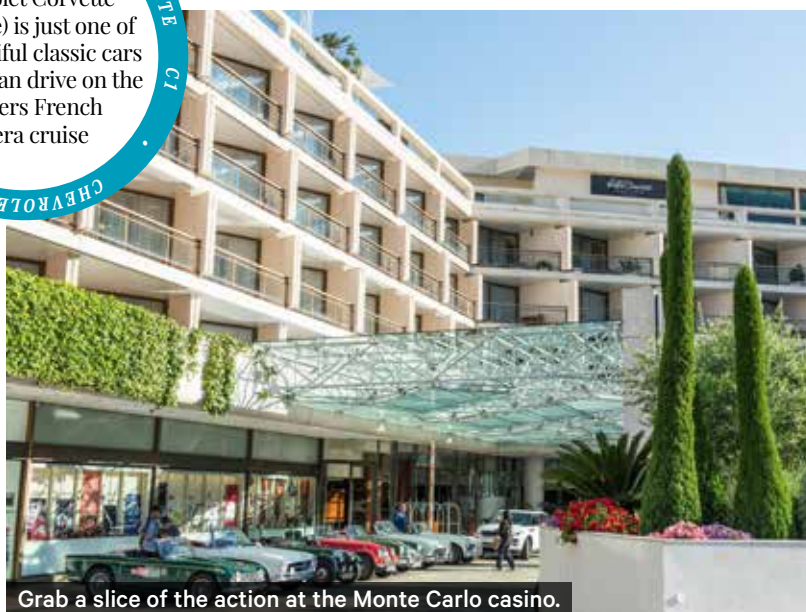
Grab a slice of the action at the Monte Carlo casino.